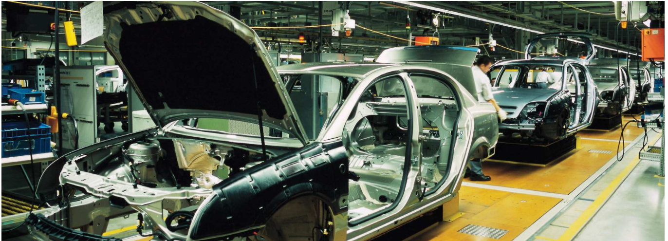
Remote access to a digital archive reduced designers' and engineers' time searching for drawings significantly. (Model photo.)