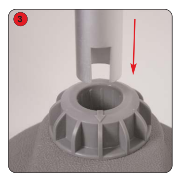
Fit the telescopic pole into the base. Align the cutout in the pole to the arrow shown on the base cap.