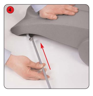
Fit the two short support arms into either side of the base.