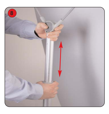
Raise the telescopic pole to the desired height to tension the graphic.