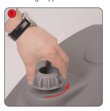
Unscrew the base cap.