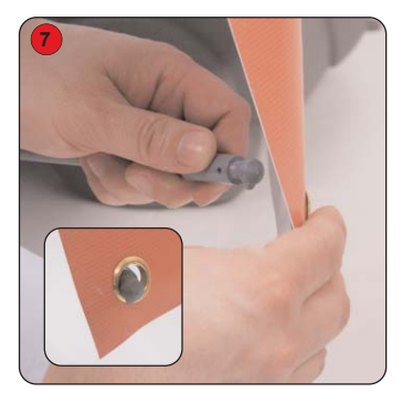
Attach the bottom graphic eyelets to the short support arms.