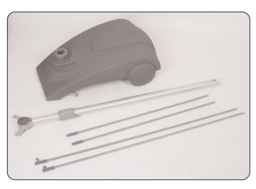
Base, telescopic pole, 2 short support arms and 2 long support arms