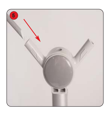
Fit the two long support arms to the telescopic pole hub Note the orientation of the support arm to the hub