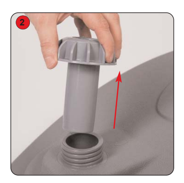
Remove the cap, fill the base with water or sand and re-fasten the cap.