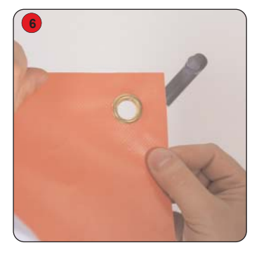
Attach the top graphic eyelets to the long support arms.